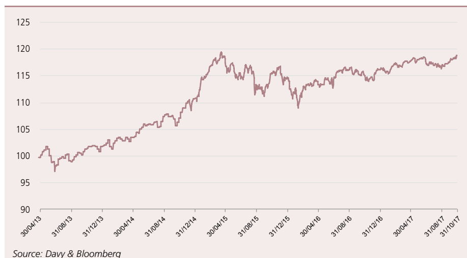
FIGURE 1: SIMULATED PERFORMANCE OF DAVY CAUTIOUS GROWTH STRATEGY

The investment objective of the Fund is to provide long term capital growth through diversification across major asset classes. Within each major asset class, allocations will be further diversified by factors including sector, geography and various strategies.