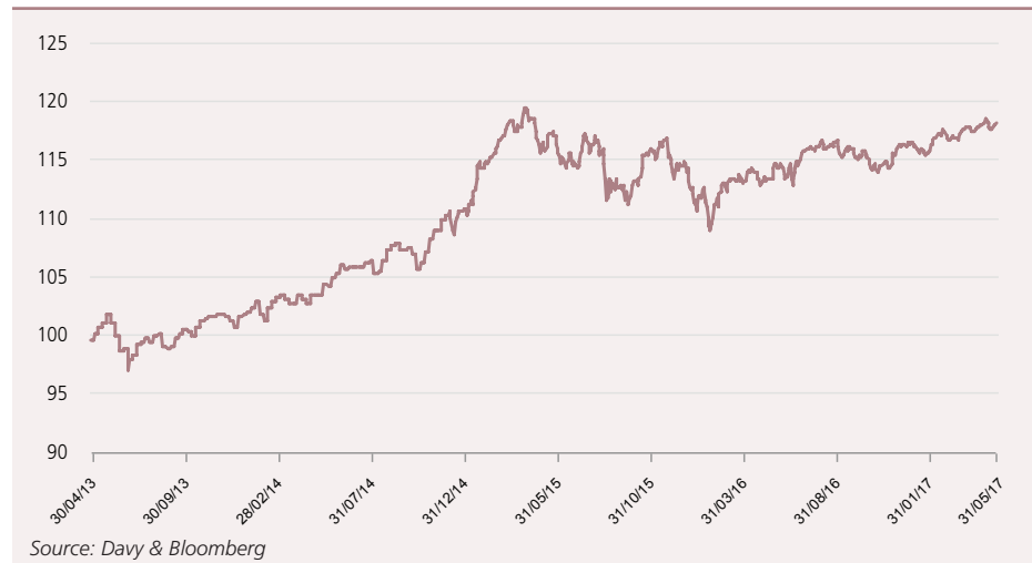
FIGURE 1: SIMULATED PERFORMANCE OF DAVY CAUTIOUS GROWTH STRATEGY

The investment objective of the Fund is to provide long term capital growth through diversification across major asset classes. Within each major asset class, allocations will be further diversified by factors including sector, geography and various strategies.