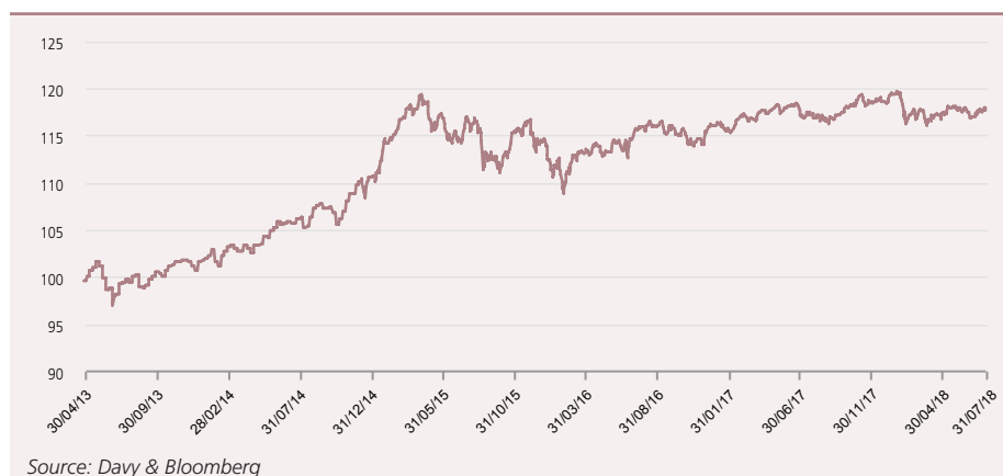
FIGURE 1: PERFORMANCE OF DAVY CAUTIOUS GROWTH FUND

The investment objective of the Fund is to provide long term capital growth through diversification across major asset classes. Within each major asset class, allocations will be further diversified by factors including sector, geography and various strategies.