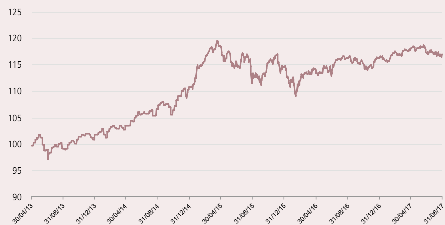
FIGURE 1: SIMULATED PERFORMANCE OF DAVY CAUTIOUS GROWTH STRATEGY

The investment objective of the Fund is to provide long term capital growth through diversification across major asset classes. Within each major asset class, allocations will be further diversified by factors including sector, geography and various strategies.